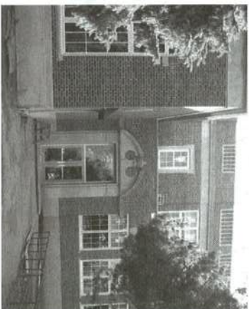
New doors at the Southwest Entrance

The closed loop geothermal heat pump system is extremely energy efficient. The installation costs are recovered within the first three years of operation. Similar systems were installed for the new high schools, Southwest and North Star. With escalating energy costs, Lincoln Public Schools searched for the most efficient and cost effective system to replace the original Randolph system. Heat pump systems (not geothermal, but electrical) are used in the most recently constructed elementary